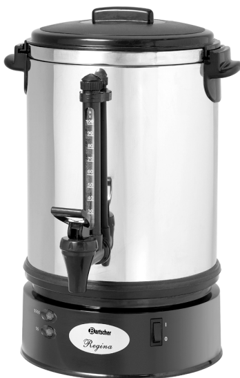
Regina 90 A190.192