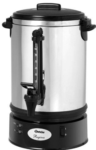
Regina 40 A190.142